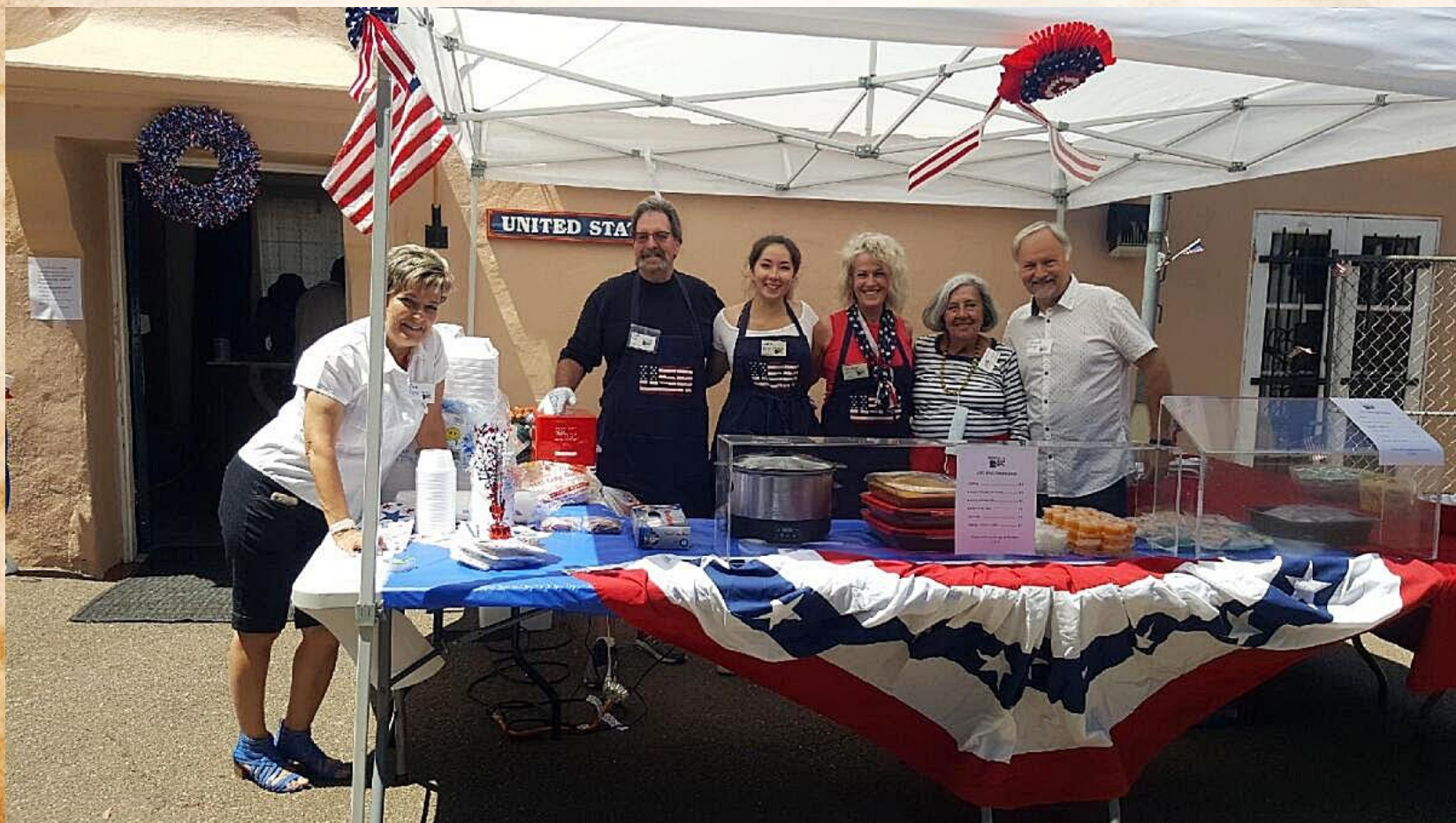
Some of our able and dedicated Crew